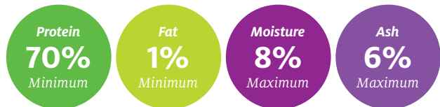
Protein-to-ash ratio of Ovalin 70 samples compared to samples of other protein sources